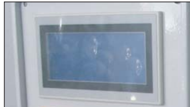
PLC control touch screen panel