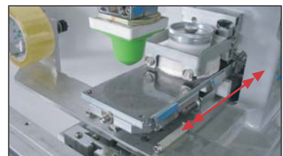
Platform in / out movement (Pad clean underneath)